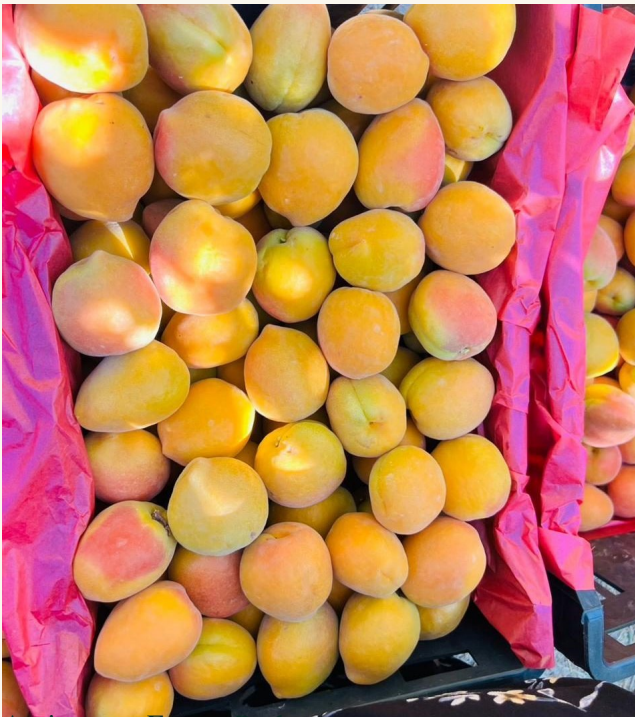
Apricots — Export Pack TISSUE LINED · READY TO SHIP