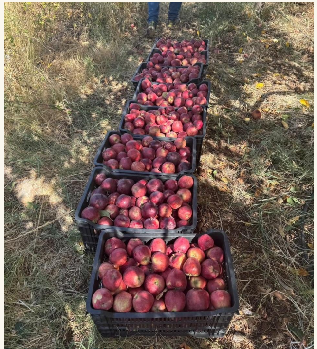
Red Apples — Bin Run HARVEST DAY