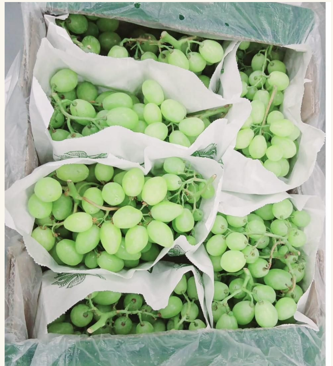
Superior Seedless BULK · PACKHOUSE