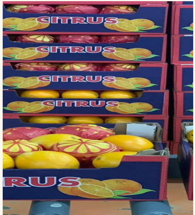
Export Cartons SEALED · READY TO SHIP