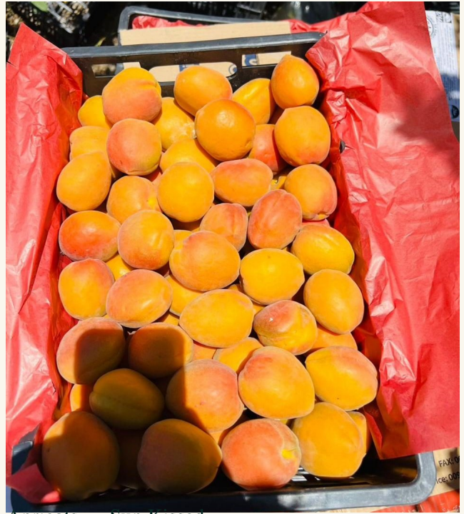
Apricots — Sun Kissed COLOR-GRADED