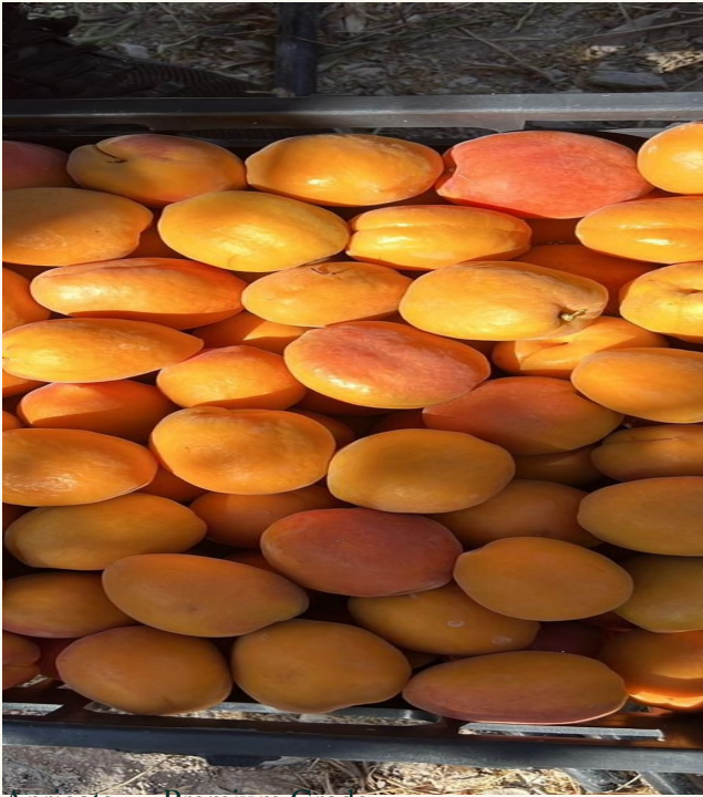
Apricots — Premium Grade FIELD CRATE · TISSUE LINED

Apricots and plums, tissue-lined for safe export.