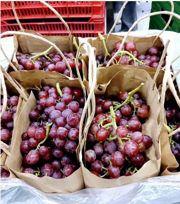
Crimson Seedless PUNNET · PAPER INNER