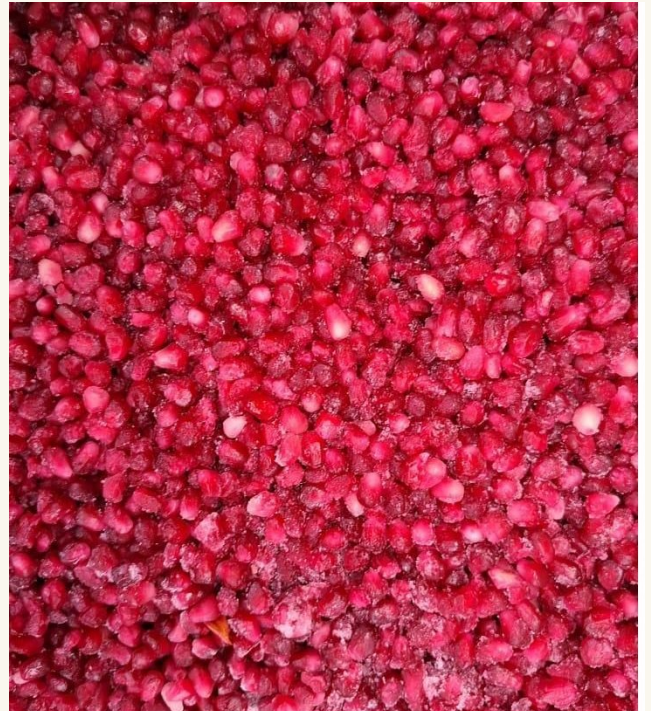
Pomegranate Arils — IQF FROZEN · BULK · FOOD-SERVICE