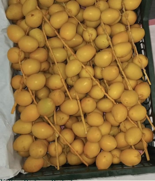
Yellow Barhi — Packed AIR-SHIPPED FRESH

Air-shipped fresh dates and IQF pomegranate arils.