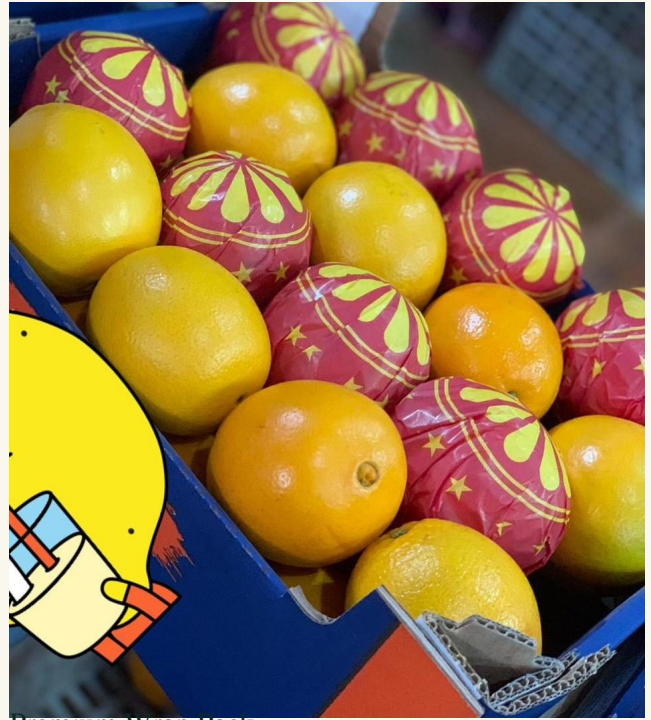
Premium Wrap Pack DECORATIVE · GIFT GRADE