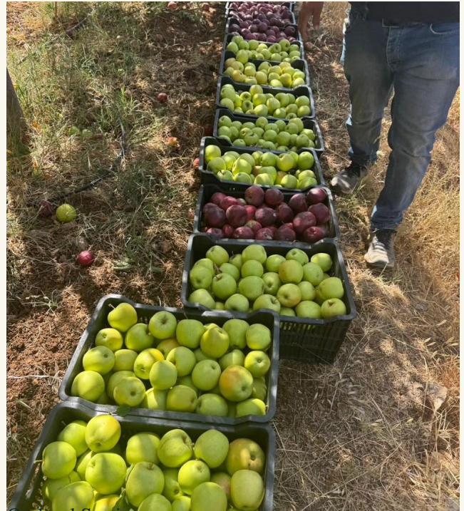
Orchard Sorting PRE-PACK LINEUP