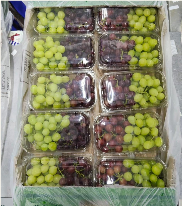
Sugaone Selection PREMIUM · RETAIL PUNNET

Crimson, Superior, Sugaone — packed for retail and wholesale.