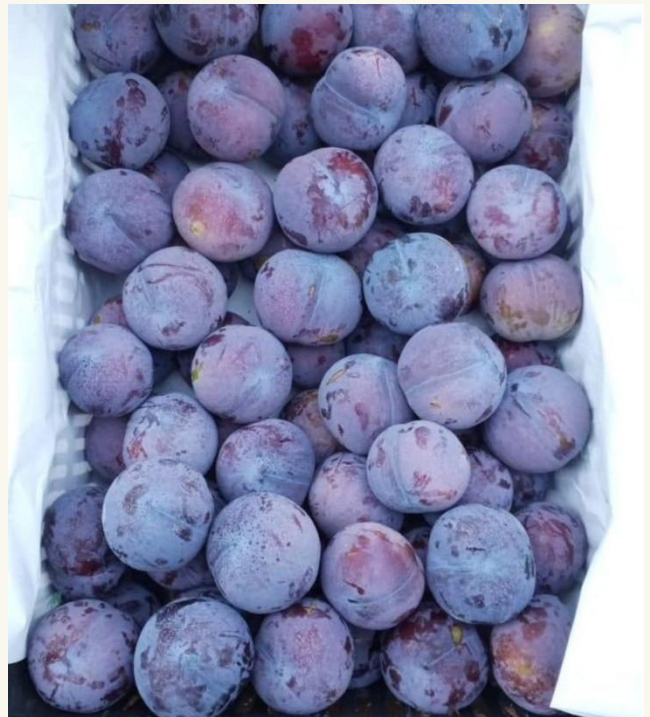
Plums — Bloom Intact FIELD HARVEST