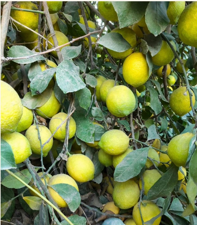
Adalia Lemons PRE-HARVEST · ON TREE