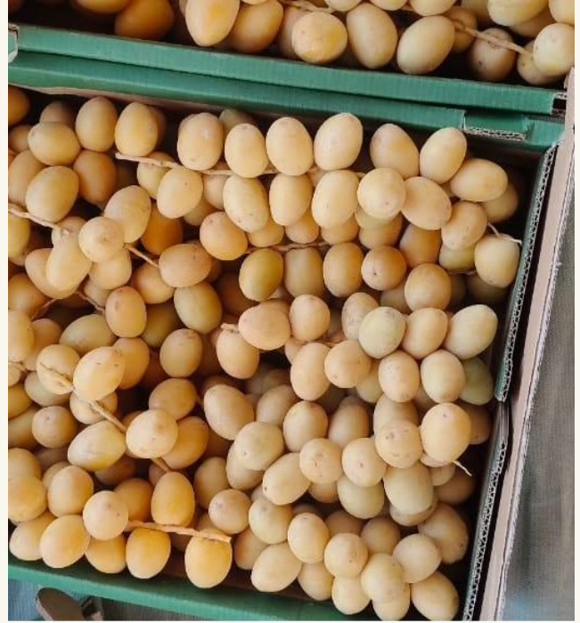
Barhi — Retail Tray CARDBOARD PACK