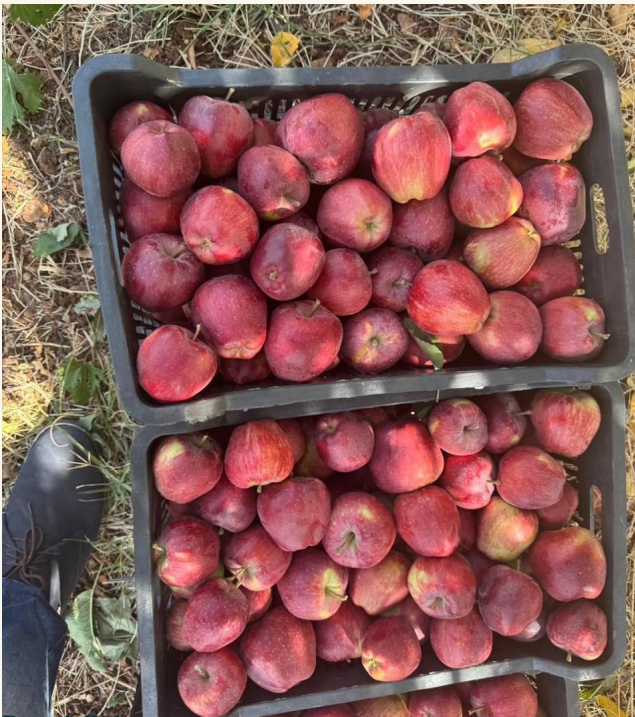
Royal Gala PREMIUM GRADE