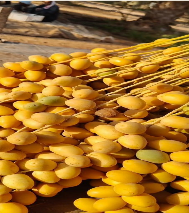
Barhi — On Stem PRE-HARVEST