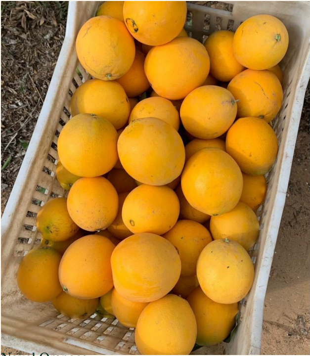
Navel Oranges FIELD HARVEST · PRE-PACK

Calibrated and packed for North American market access.