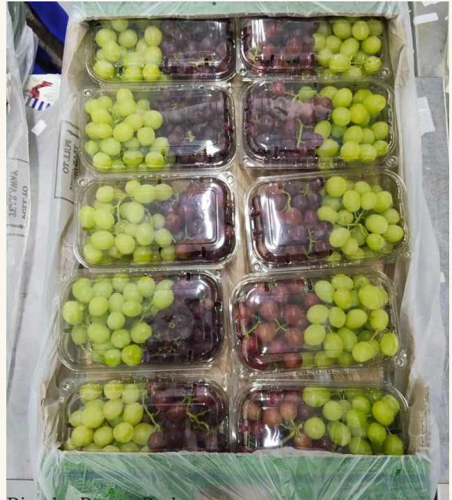
Bi-color Punnet Pack 500G · CLAMSHELL