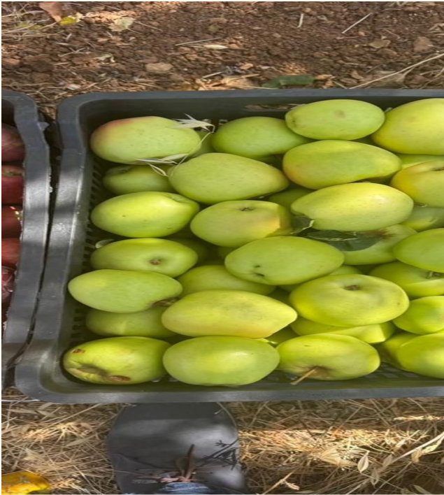
Tri-Color Selection MIXED VARIETIES

Royal Gala, Anna, Golden Delicious — sized for retail.